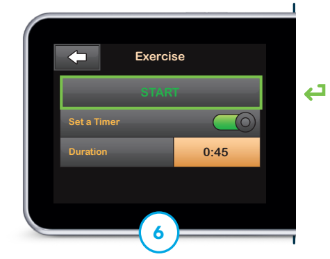
Tap START to turn on the Exercise Activity.

Use the keypad to enter the desired time. Tap 💙 to continue.