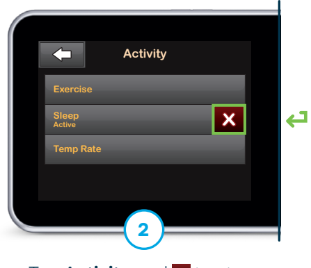
Tap Activity and ➤ to stop. Tap Sleep and then START to manually turn it on.

When enabled, an icon will display on the Home screen. To turn it off, tap OPTIONS.