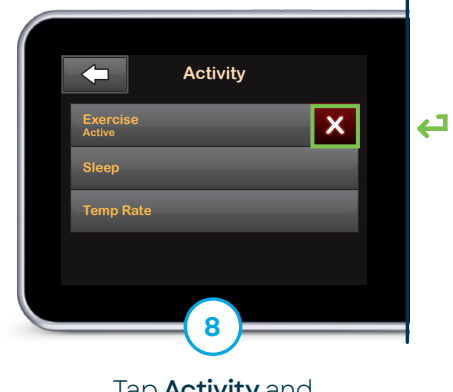
Tap Activity and then × to stop.

When enabled, an icon will display on the Home screen. To turn it off, tap OPTIONS.