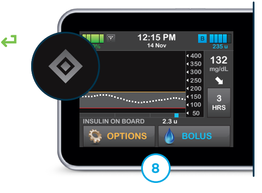
A status icon will display on the Home screen when Control-IQ+ is turned on.