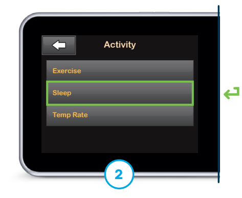
Tap Sleep , Sleep Schedules , and then tap a schedule to program.

From the Home screen, tap OPTIONS and then Activity .