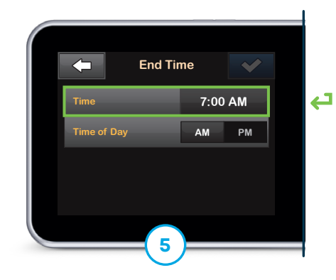
Repeat the same process to configure the End Time. Tap 🖍 to save the settings.