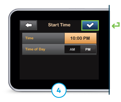
Tap Start Time and then Time . Enter the desired time. Tap 🖍 and then tap 🖍 again.