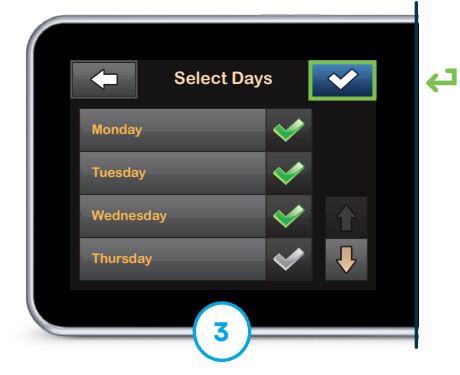
Tap Select Days and then tap each day of the week that applies. Tap ✓ to continue.