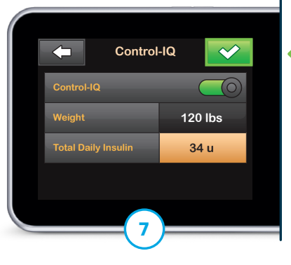
Tap Total Daily Insulin and use the keypad to enter the value. Tap ✓ to continue.